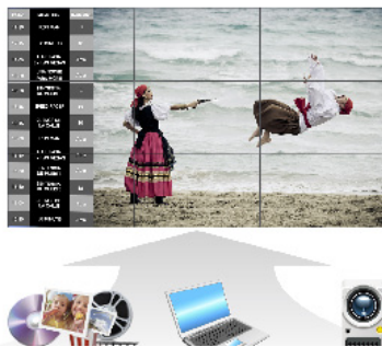
Figure 2. Various types of media, PC screen and live camera can be displayed on VideoWall.

Information housed in the MagicInfo Premium Server or a LAN can be combined and displayed. Content can be scheduled, shuffled and played on programs timed down to a specific second, hour, day, week or year.