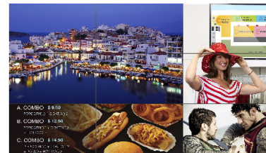
Figure 3. Content from multiple peripheral screens can be displayed simultaneously in real time.

With MagicInfo VideoWall Edition, an organization can display content from multiple peripheral screens simultaneously in real time. Live images from PCs or Samsung IP cameras can be displayed alongside preloaded pictures and video clips, or combined together. The result is flexible content options that help delight viewers and hold their attention.