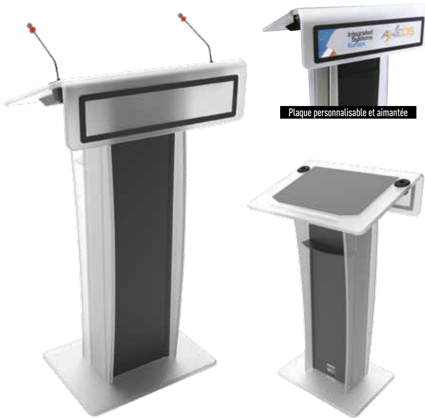
Plaque personnalisable et aimantée

The NEONYX is a stylish and robust lectern, available in different configurations. Besides the standard version, it can accommodate a 19" touch screen as well as being adjustable in terms of height. It incorporates all the essential functionalities for your events, receptions, seminars or conferences.